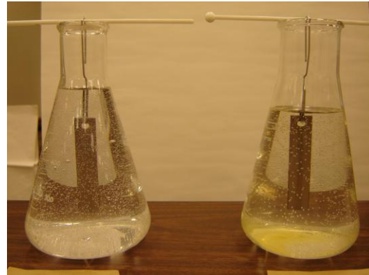
Figure 3: Corrosion Inhibition

Figure 3 shows the effects of city water on mild steel corrosion coupons. The coupon on the right is in untreated city water and already shows signs of corrosion after only four hours of exposure. Notice the discoloration of the water and the corrosion byproducts on the bottom of the flask. The coupon on the left is treated with a corrosion inhibitor and shows no visual signs of corrosion.