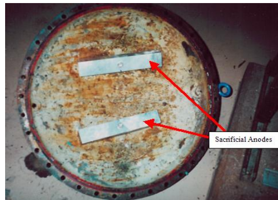
Figure 4: Sacrificial Anodes in Chiller Endcap