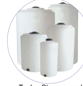
Tanks, Storage, and Chemical Containment; Poly and Fiberglass