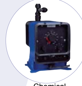
Chemical Feed Pumps