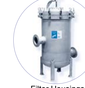
Filter Housings, Filter Elements