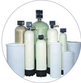
Softeners, Carbon Filters, Iron Removals