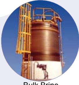
Bulk Brine Systems