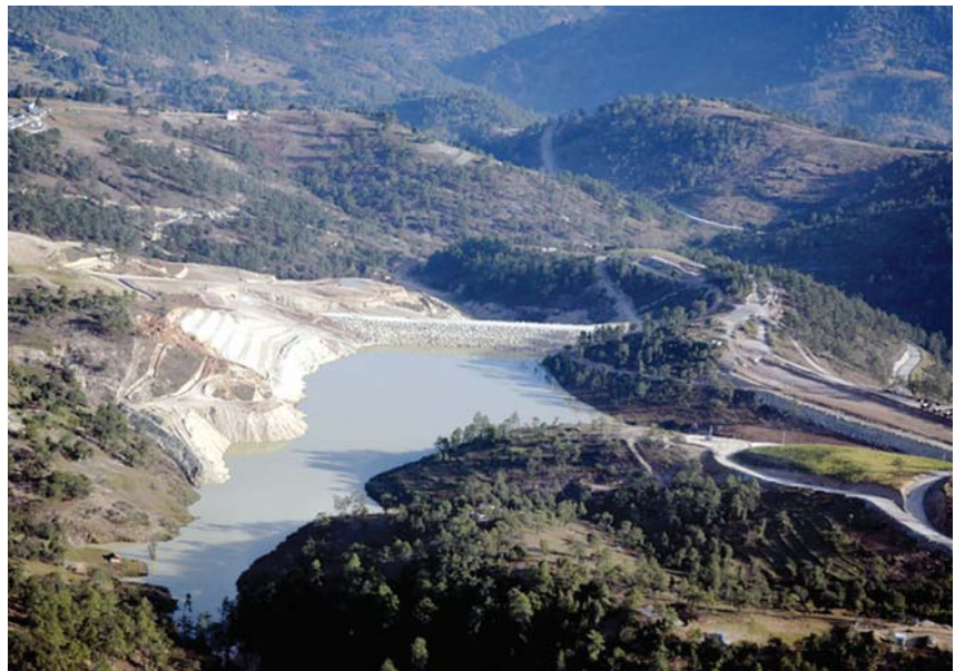
An aerial view of Marlin mine's tailings impoundment. With the safety and well being of the land, waters, and population in mind, Marlin mine is highly committed to operating an ultra-safe and environmentally sound mining operation. The new multi-phase cyanide and metals removal plant will help ensure that it continues to do so.