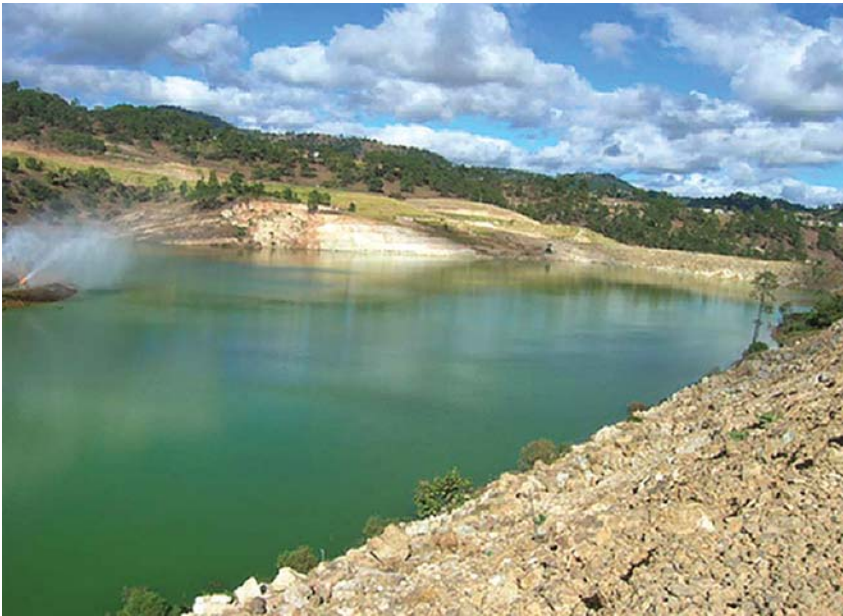
The tailings water generated from the milling operation is treated with an air cyanide removal technology prior to discharge to the mine's tailings impoundment. The impoundment currently has a capacity of 4 million m 3 and is expected to expand to nearly 20 million m 3 by the end of the mine's life.

tation, would be the most effective treatment. Iron sludge adsorption and the addition of the heavy metal chelating agent was selected to remove primary Hg.